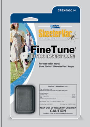
FineTune® Replacements (Model no. CPSX000014)